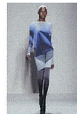
RTW Fall 2011