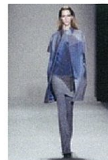
RTW Fall 2011