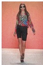
RTW Spring 2012 Video