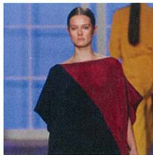
Tommy Hilfiger Spring 2012 Review