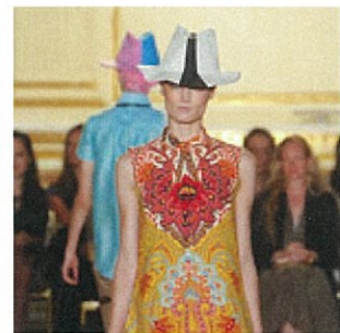
Thakoon Spring 2012 Review