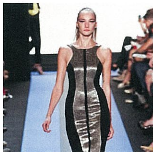
Spring 2012 Trend: Sporty Chic